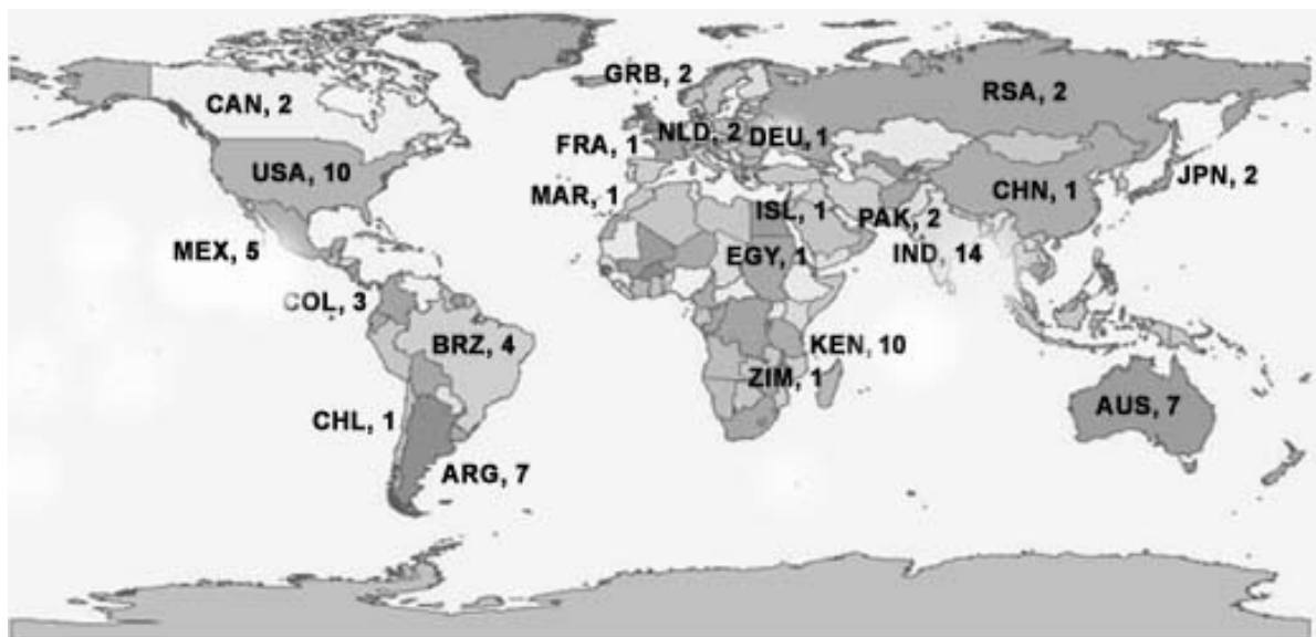
Fig. 2. Countries where the ancestors of Nepalese improved wheat cultivars were originated. Wheat genes of these countries are playing in Nepal (See table 5 for country code description, value after country code indicates total ancestors, origin of 9 ancestors are unknown).