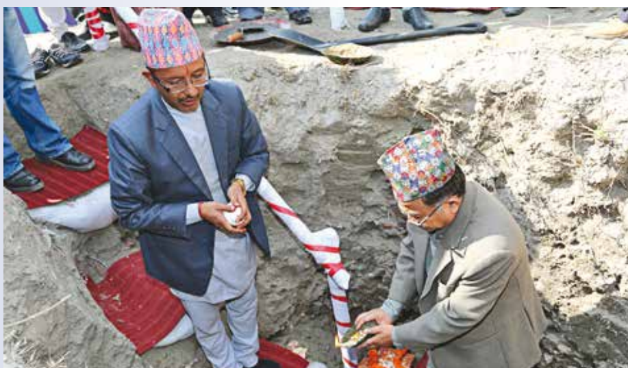
The then Rt. Hon'ble CJ Kalyan Shrestha laying the foundation stone

On this occasion the then Rt. Hon'ble Chief Justice Shrestha, delivering his keynote speech, observed that continuous judicial education is indispensable for judicial capacity building. Throwing light on the background of the establishment of NJA-Nepal, he expressed full appreciation for the collective efforts put in by the Executive Director and NJA team for organizational development and judicial reform. The then Rt. Hon'ble Chief Justice further noted that despite limited resources and several constraints, NJA-Nepal has been successful in conducting several meaningful programmes for judicial capacity enhancement of its stakeholders which is suffice to put