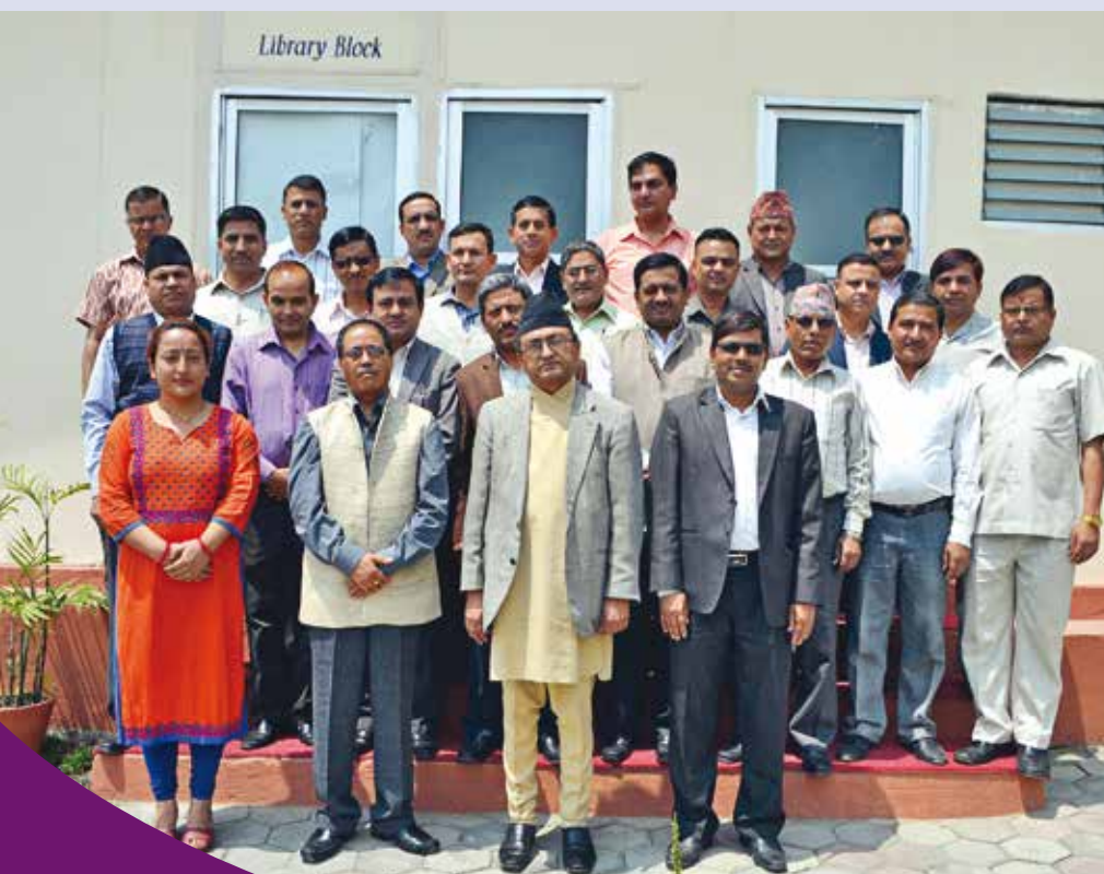
Participant Hon'ble District Judges with ED Hon'ble K.R. Pandit, Hon'ble Judge Dwarika Man Joshi and Faculty/Judge Hon'ble R.R. Acharya

In order to enhance skills and knowledge on adjudication of land disputes, NJA-Nepal organized a Training on Land Administration for Judges of District Courts from May 9 to 14, 2016 at Manamaiju, Kathmandu. The topics discussed and deliberated upon in the sessions included land administration in Nepal, transfer of ownership of land, survey of land, land belonging to Trust and its management, inheritance property, technicality of land disputes etc. Group exercises were also conducted to make the training more effective and practical. Justices of Supreme Court, Judges of Courts of Appeal and experts in the field of land administration and trust were invited as resource persons to lead the sessions. There were altogether 22 participants in the programme which was coordinated by Faculty Member / District Judge Hon. Rishi Ram Acharya.