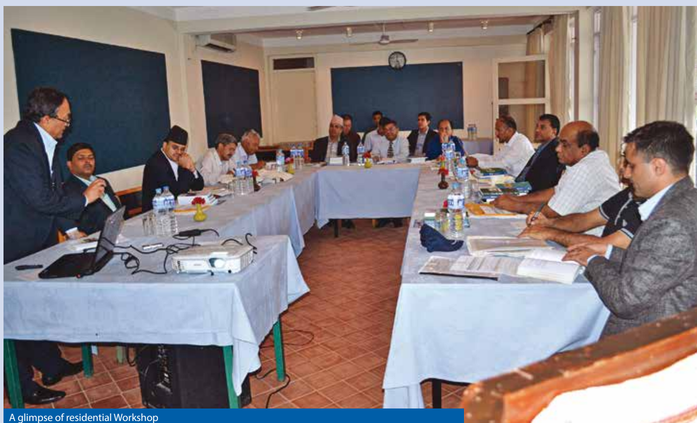
A glimpse of residential Workshop