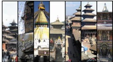
Seven monument zones, Kathmandu Valley

Kathmandu Valley (1979): The site with seven groups of monuments and buildings reflects the historic and cultural richness of Nepalese art and architecture, showcasing highly developed Newar craftsmanship in brick, stone, timber and bronze. The site includes following seven monument zones: