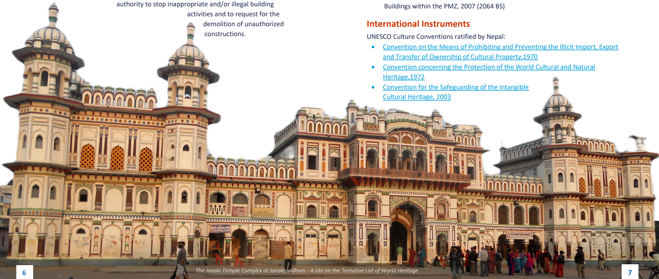
The Janaki Temple Complex at Janakpur - A site on the Tentative List of World Heritage

The Department of Archaeology (DoA) is subsequently responsible for the protection of the site, including the prescription of building bylaws, approving requests for building permits and for any other construction activities within the zone. The DoA is given the authority to stop inappropriate and/or illegal building activities and to request for the demolition of unauthorized constructions.