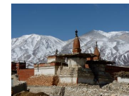
Chorten at Tsharang, Mustang

The DoA provides the technical assistance to local communities and agencies for monument conservation. It also acts as a focal agency for the evaluation of the Heritage Impact Assessment for any activities in and around the PMZ, heritage/ archaeological sites or monument/s that may have a negative effect on the heritage structures and their values.