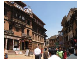
Houses in the core of Bhaktapur

The DoA through its committee gives advices to the house owners as to the style or standard of the house or building to be constructed in the private open land within the PMZ; and to make necessary provisions with regard to conserving the historical, cultural, archaeological and religious values of the ancient monuments which have been regarded important from historical and artistic point of view.