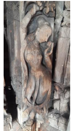
Wooden decorative strut recovered from debris during the 2015 Gorkha Earthquake