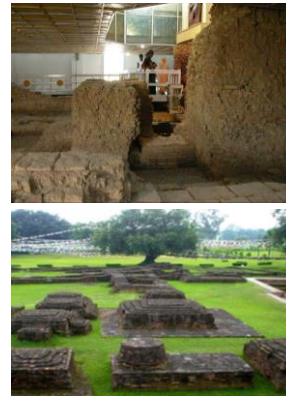
Archaeological remains at Lumbini

Located in the Rupandehi district, Lumbini is the birthplace of Siddhartha Gautama. This site includes the Mayadevi Temple complex, including remains of various monastic ensembles symbolizing the origin of Buddhism. It holds immense spiritual significance and attracts pilgrims and visitors from around the world.