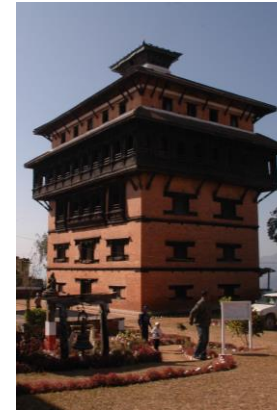
7-storey Nuwakot Durbar

Our mission is multifaceted and driven by a dedication to the cultural heritage of Nepal. We strive to conduct thorough archaeological exploration and excavation, publishing comprehensive reports to contribute to the global understanding of our shared history. Through meticulous research on Nepalese history, culture, and archaeology, we aim to deepen global knowledge and appreciation.