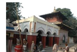
Ram Mandir, Dhanusha, Janakpur

We are committed to providing technical assistance in documenting and protecting heritage at risks, including those in the remote areas, in close coordination with local and provincial levels and involvement of the communities concerned.