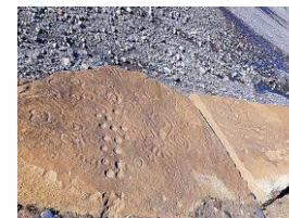
Petroglyphs at Mustang

At the heart of our mission is a commitment to preserving Nepal's historical treasures and cultural heritage. Our responsibilities extend to managing museums and archaeological objects, thereby contributing to the scholarly understanding and appreciation of the nation's cultural legacy.