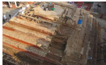
Archaeological research of a tiered temple foundation at Jaisidewal, Kathmandu