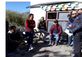
Engaging with Communities

At the heart of our mission is a commitment to preserving Nepal's historical treasures and cultural heritage. Our responsibilities extend to managing museums and archaeological objects, thereby contributing to the scholarly understanding and appreciation of the nation's cultural legacy.