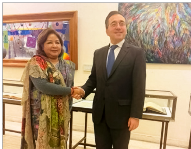
The Foreign Minister with the Minister of Foreign Affairs, European Union and Cooperation of Kingdom of Spain