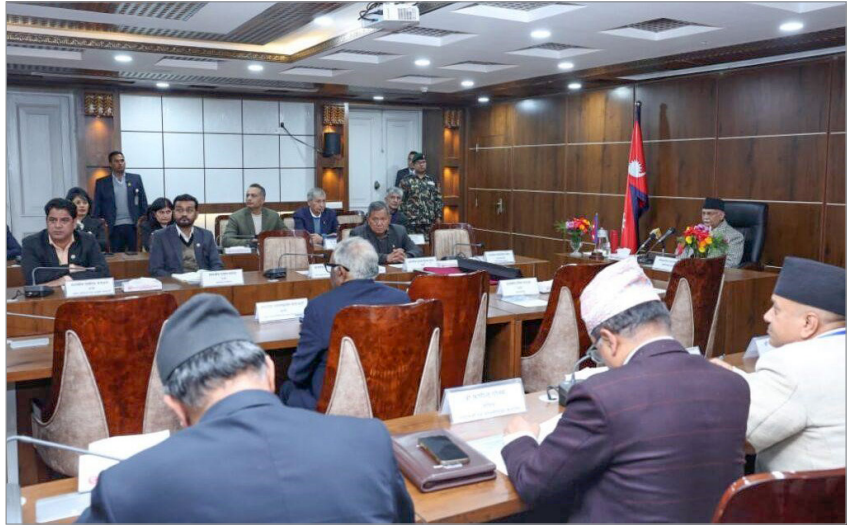
The Prime Minister announcing the first edition of Sagarmatha Sambaad

The Prime Minister highlighted Nepal's leadership in climate stewardship despite its minimal contribution to global emissions. He reaffirmed Nepal's commitment to achieving net-zero emissions by 2045 and called for collective global action to safeguard shared natural resources. Noting Nepal's unique geopolitical position and cultural heritage of discussion and dialogue, he invited nations, institutions and civil society to join hands through the Sagarmatha Sambaad platform to advance inclusive, sustainable and resilient solutions for a better future.