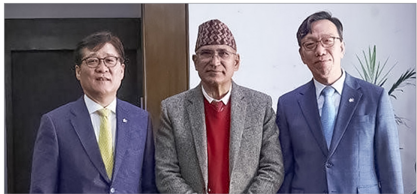
The Deputy Prime Minister and Finance Minister with Special Envoy of the Minister of Foreign Affairs of the Republic of Korea