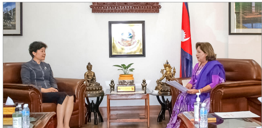
The Foreign Minister with the Vice President of GNFCC of Shanghai Cooperation Organization and Former Vice Minister of the National Health Commission of China

During the visit, the Chinese delegation also participated in the "Founding Ceremony of the China – Nepal Lifeline Express Centre of