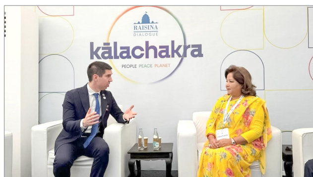
The Foreign Minister with the Deputy Prime Minister and Minister of Foreign Affairs of Moldova

Security Council of the United States of America.