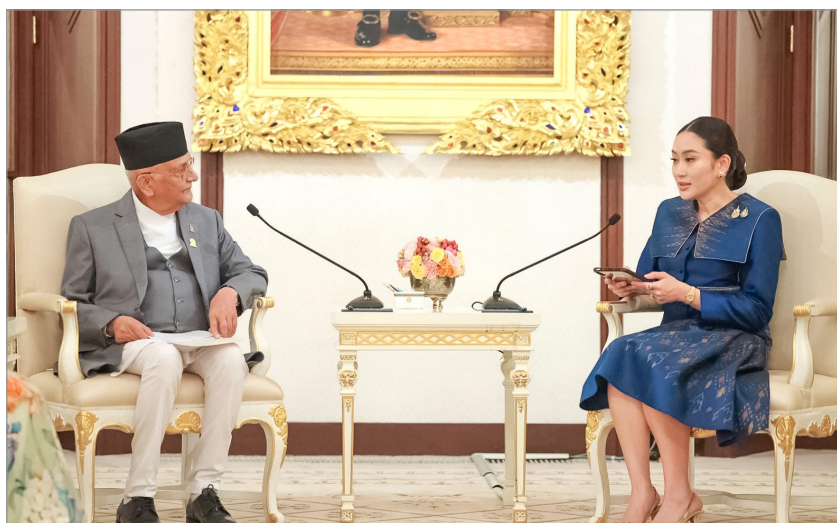
Prime Minister Mr. KP Sharma Oli with Prime Minister of Thailand Ms. Paetongtarn Shinawatra

During the talks, both Prime Ministers expressed their satisfaction over the existing state of bilateral relations and