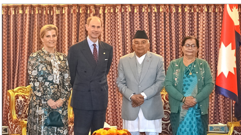
President Mr. Ramchandra Paudel receiving the Duke and Duchess of Edinburgh at his Office

The Duke and Duchess of Edinburgh of the United Kingdom (UK) visited Nepal from 4 to 9 February 2025. During their stay, the Duke and Duchess paid a courtesy call on President Mr. Ramchandra Paudel at the Office of the President. Matters related to further deepening the age-old ties of friendship and cooperation between Nepal and the UK were discussed. During the call on, the President also received the Annual Report-2024 of British Gurkhas. The Duke and Duchess also visited various