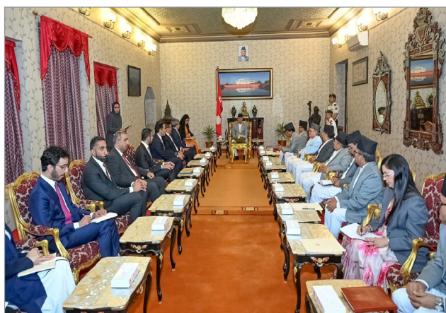
Courtesy call on the President of Nepal by the Deputy Prime Minister and Minister for Foreign Affairs of the UAE

Prime Minister Mr. KP Sharma Oli prior to his departure to Abu Dhabi.