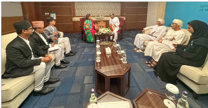
The Foreign Minister in a bilateral meeting with Mr. Sayyid Badr bin Hamad bin Hamood Albusaidi, Foreign Minister of the Sultanate of Oman

During the visit, two Memorandums of Understanding (MoUs) were signed, one on tourism cooperation and the other on collaboration between