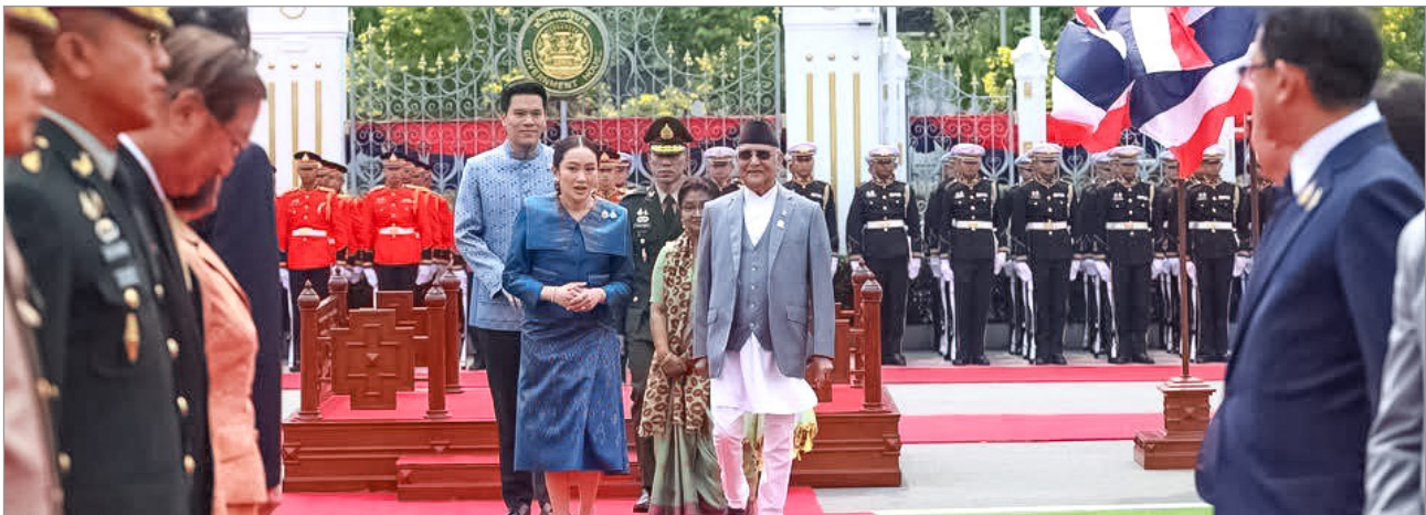
The Prime Minister receiving the Guard of Honour

accorded a guard of honour at the Government House in Bangkok.