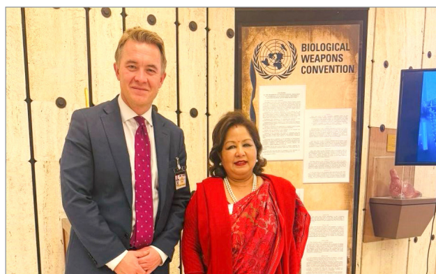
The Foreign Minister with the Deputy Foreign Minister of Norway