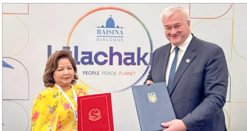
The Foreign Minister with the Minister of Foreign Affairs of Ukraine

Also on the sidelines, Nepal and Ukraine signed an agreement on visa exemption for holders of diplomatic and service passports in New Delhi on 18 March 2025. Foreign Minister Dr. Arzu Rana Deuba and Minister for Foreign Affairs of Ukraine Mr. Andrii Sybiha signed the Agreement. This Agreement aims to facilitate smoother travel for official and diplomatic personnel between the two nations.