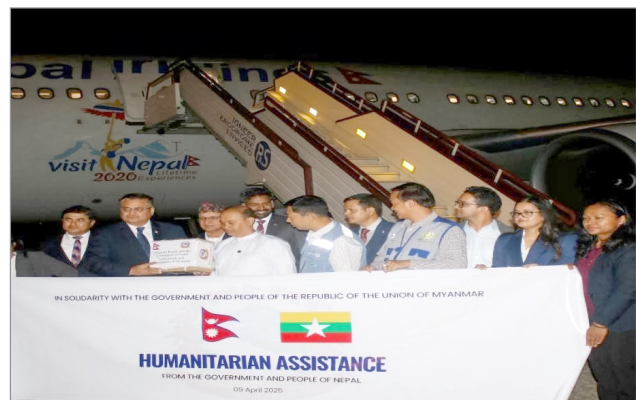
Handing over the relief materials