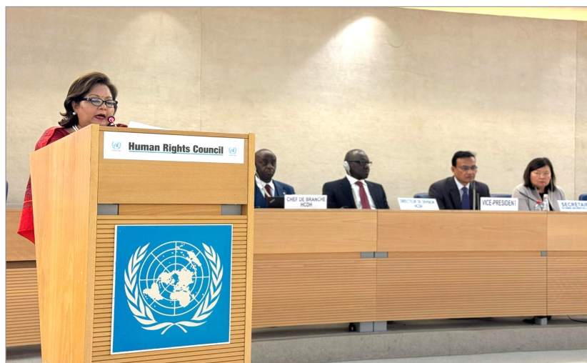
The Foreign Minister addressing the High-Level Segment of the UN Human Rights Council

The Foreign Minister delivered the national statement in the Council on 24 February 2025 where she reaffirmed Nepal's commitment to human rights. Highlighting Nepal's constructive engagements with human rights instruments and mechanisms as well as the history of the nationally-led peace process, she stressed on the challenges due to the impact of anthropogenic climate change and the invasion of the private sphere by digital technology. She also announced Nepal's candidacy for the membership of Human Rights Council for the