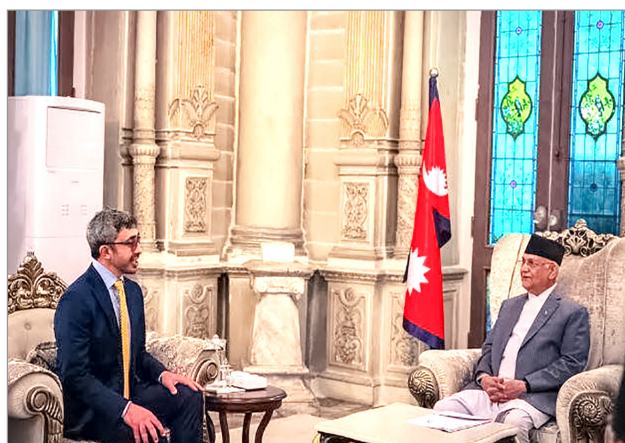
Courtesy call on the Prime Minister by the Deputy Prime Minister and Minister for Foreign Affairs of the UAE