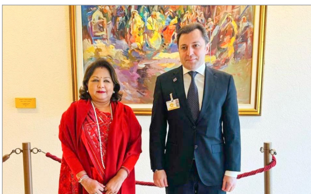
The Foreign Minister with the Deputy Foreign Minister of Azerbaijan