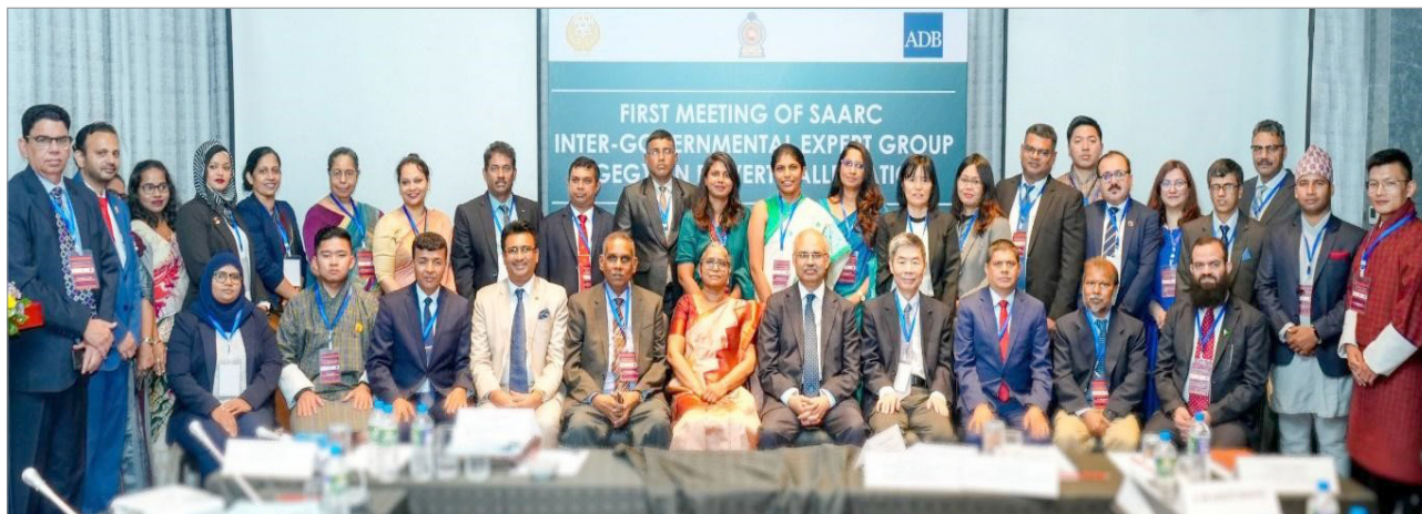
The First Meeting of SAARC Inter-Governmental Expert Group on Poverty Alleviation and SDGs

and Theme of the SAARC Development Report (SDR) to be published biennially as a tool of monitoring the progress on SDGs in SAARC Region.