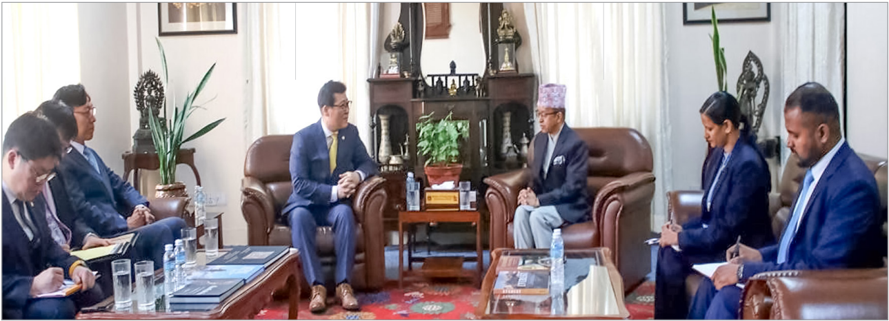
The Foreign Secretary with the Special Envoy of the Minister of Foreign Affairs of the Republic of Korea