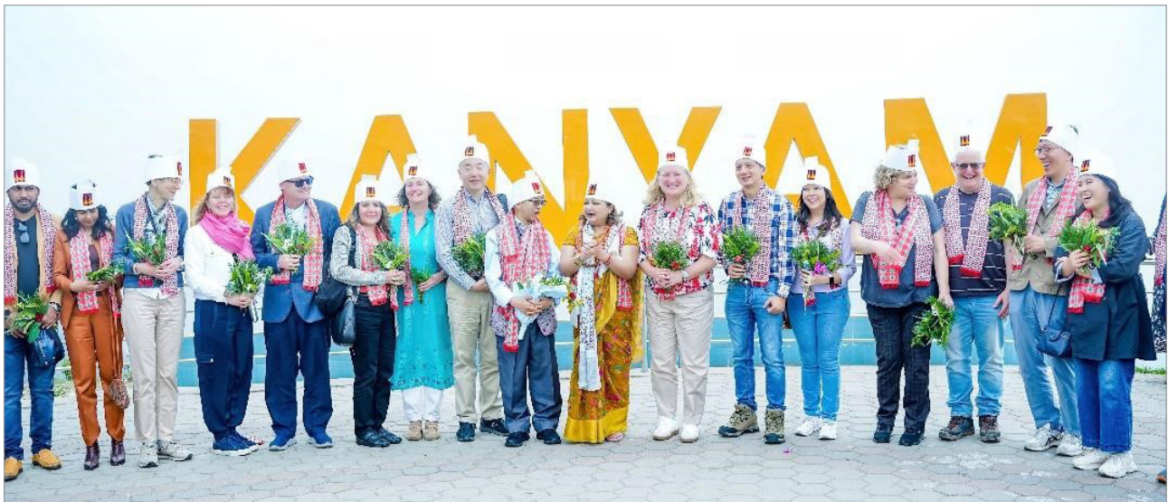
The Foreign Minister and the participants of the Diplomatic Retreat at Kanyam, Ilam

dressed in different traditional cultural attires and enjoyed activities like horse riding, sight-seeing and cultural shows. Later in the evening, Foreign Minister Dr. Arzu Rana Deuba hosted a welcome dinner which concluded with a cultural programme.