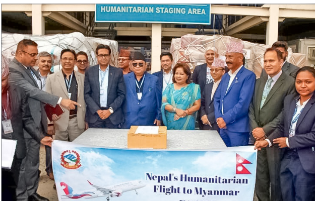
Relief materials ready for dispatch overseen by the Foreign Minister

Nepal also expressed its deepest condolences to the Government and people of Myanmar for the loss of lives and destruction caused by the earthquake.