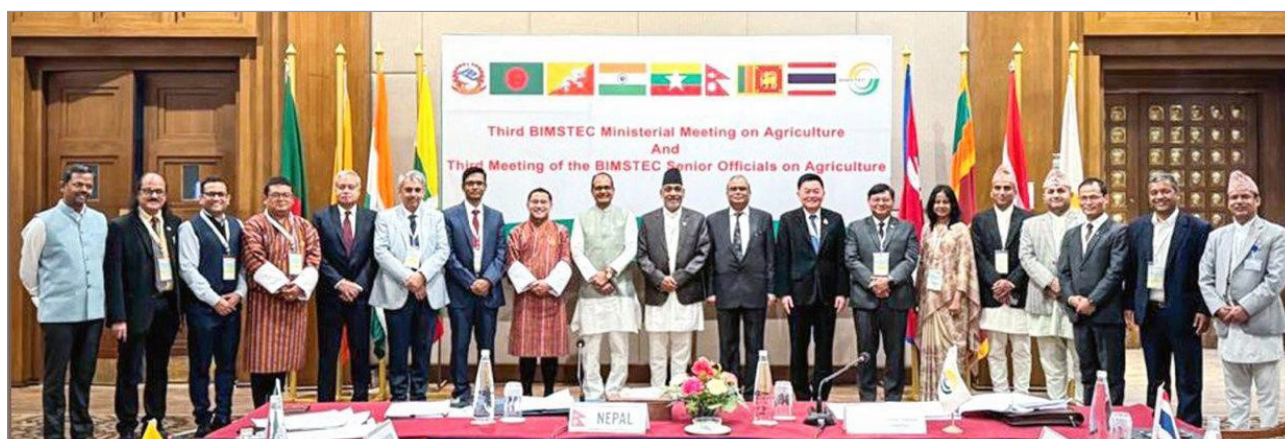
BIMSTEC Agriculture Ministers, Secretary General and other high officials attending BIMSTEC Ministerial Meeting on Agriculture in Kathmandu

Seed Reserves and adopted the Plan of Action on BIMSTEC Fisheries and Livestock Cooperation.