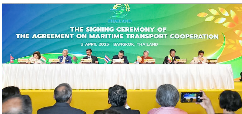
Foreign Minister Dr. Arzu Rana Deuba, together with her counterparts from BIMSTEC Members, signing the BIMSTEC Agreement on Maritime Transport Cooperation at a special event in Bangkok

Joint Statement on the Impact of Earthquake in Myanmar and Thailand; and the Summit Declaration. Going by the procedure, Bangladesh assumed its responsibility as Chair of the BIMSTEC.