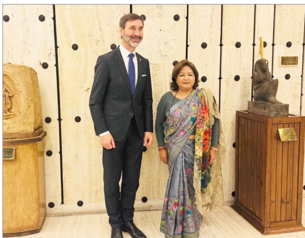
The Foreign Minister with the Minister of Foreign and European Affairs of the Slovak Republic