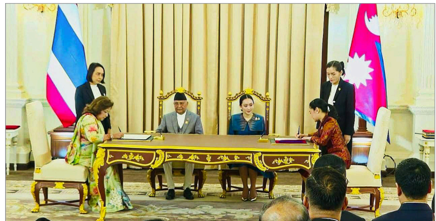
MOU/Agreement signing ceremony

Ministers, Nepali and Thai private sectors also signed six MOUs with a view to enhancing private sector engagements and cooperation in