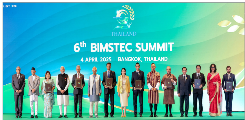
Respective Heads of Delegation to the 6th BIMSTEC Summit held in Bangkok, Thailand on 4 April 2025

On the sidelines, the Prime Minister held separate bilateral Meetings with Shri Narendra Modi, Prime