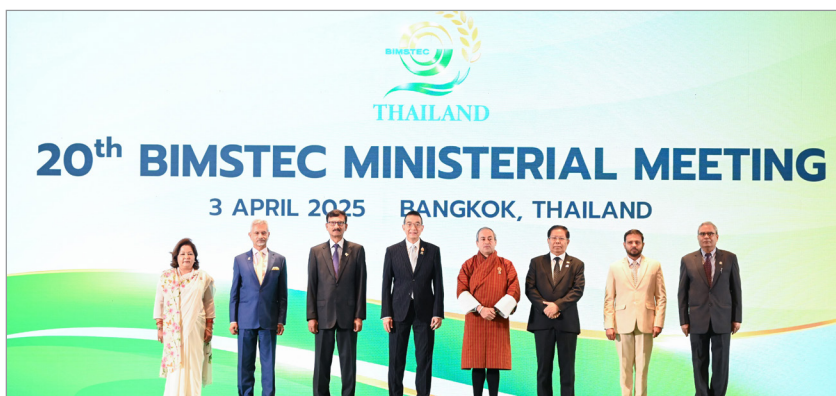
The Foreign Minister at the 20th BIMSTEC Ministerial Meeting