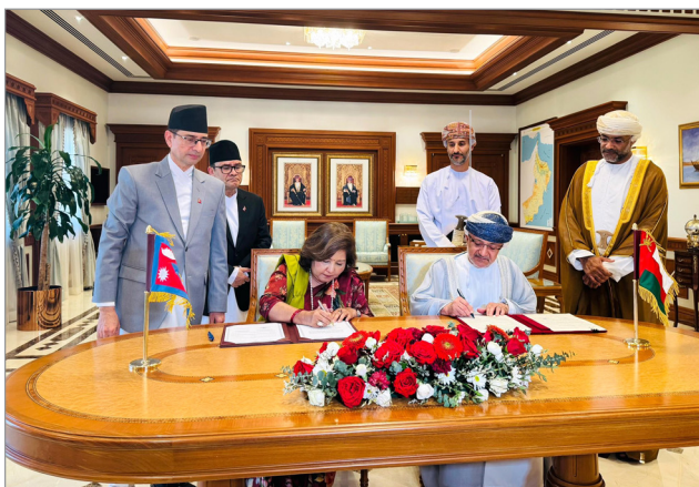
Foreign Minister Dr. Arzu Rana Deuba and Mr. Salim bin Mohammed Al Mahrouqi, Minister of Heritage and Tourism of the Sultanate of Oman signing the MoU on Cooperation in the Field of Tourism

On 18 February, she visited the Embassy of Nepal in Muscat, held a virtual meeting with Nepali Ambassadors/Heads of Missions in GCC countries and interacted with the Nepali community in Oman at a programme organized by the Embassy.