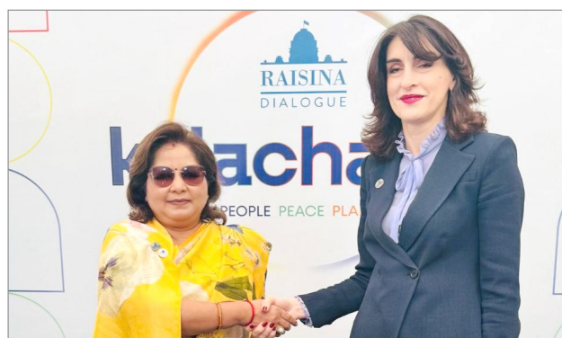
The Foreign Minister with the Minister of Foreign Affairs of Georgia