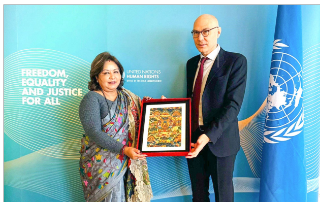
The Foreign Minister with the UN High Commissioner for Human Rights