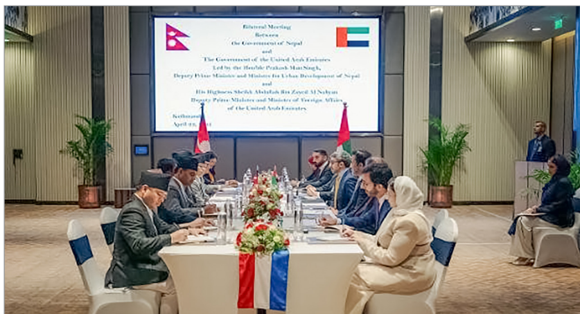
Delegation-level meeting between Nepal and UAE

A bilateral delegation-level meeting was held between Nepal and UAE led respectively by Mr. Prakash Man Singh, Deputy Prime Minister and Minister for Urban Development, and Sheikh Abdullah bin Zayed Al Nahyan. The two sides discussed various aspects of bilateral relations, focusing on enhancing cooperation in trade, economic partnership, labour, tourism and climate change.