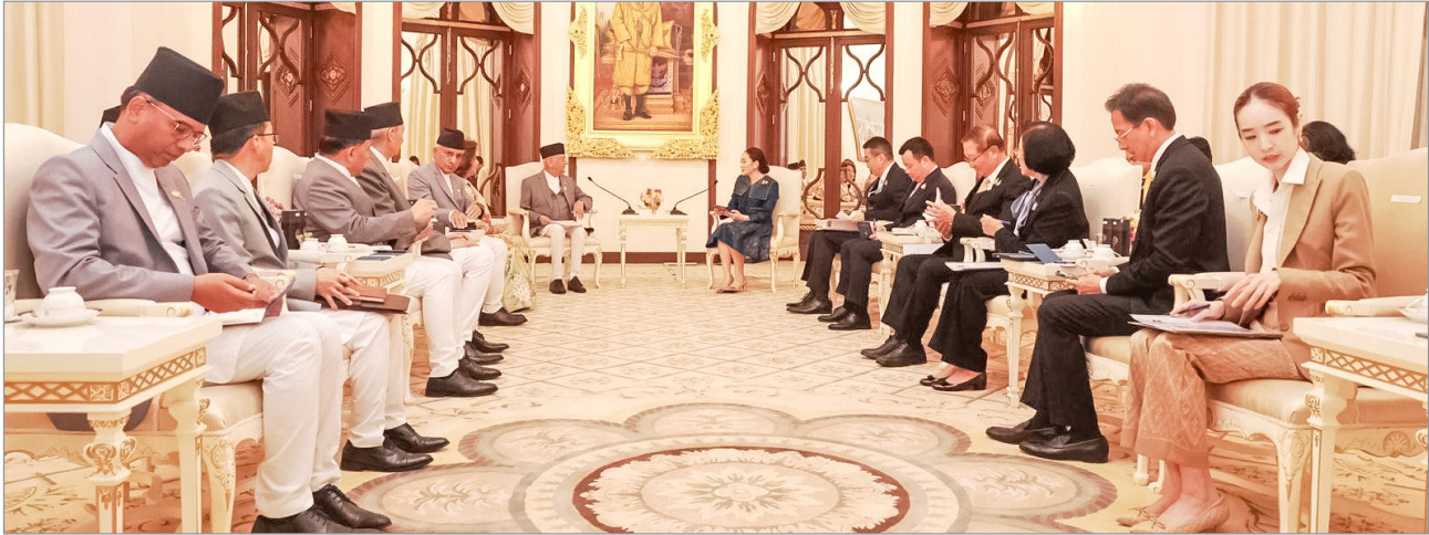
Delegation-level talks between the Prime Ministers of Nepal and Thailand

to strengthen Nepal-Thailand cooperation at regional as well as multilateral levels.