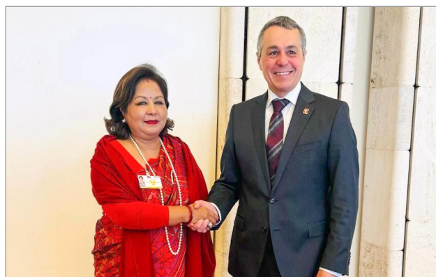
The Foreign Minister with the Foreign Minister of Switzerland