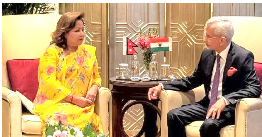
The Foreign Minister with the External Affairs Minister of India