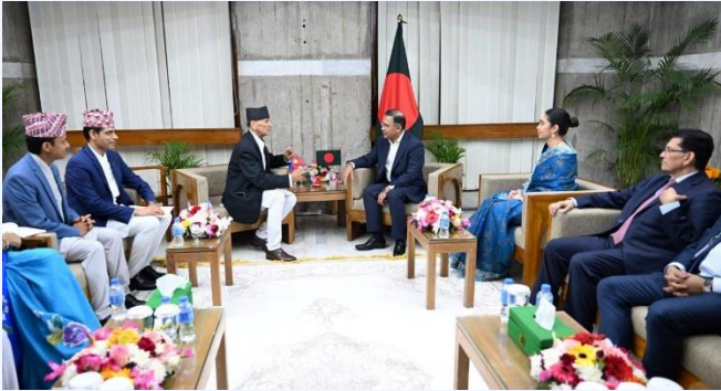
(Foreign Minister and his delegation in a meeting with the Prime Minister and his delegation)

Prime Minister Mr. Rahman thanked the Foreign Minister for attending the Oath-taking Ceremony and underscored that his visit reflects the solidarity and goodwill of the Government and people of Nepal towards the Government and people of Bangladesh.