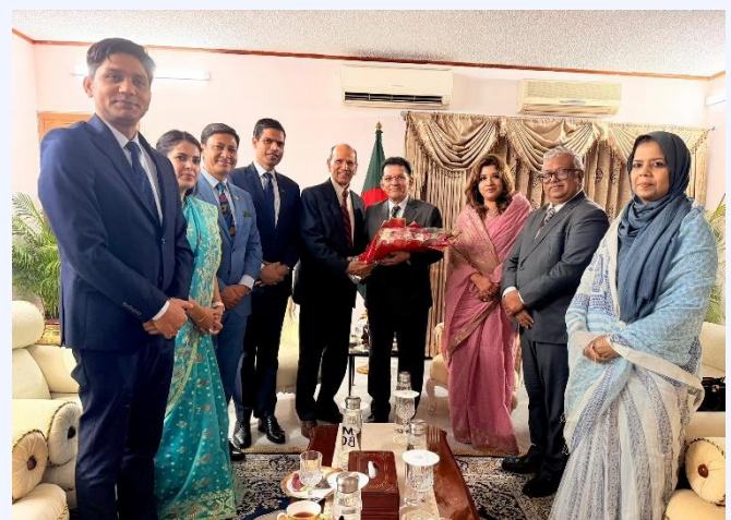
(Foreign Minister and his delegation with the Foreign Minister and State Minister for Foreign Affairs of Bangladesh)

They deliberated on ways to strengthen bilateral ties, with a focus on economic partnership. The discussion highlighted the significant untapped potential in areas such as trade, energy, connectivity, and tourism. Both Ministers reaffirmed their commitment to work closely across bilateral, regional, and multilateral platforms, advancing the shared interests of the two countries and peoples.