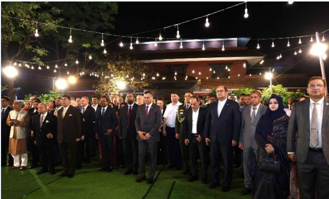
(Guests attending Nepali Army Day Celebration)

Participants in the event included government officials of Bangladesh, ambassadors and heads of mission, high-ranking officers from the armed forces of Bangladesh, defence attachés, business and civil society leaders, and representatives from the Nepali community based in Dhaka, among others.