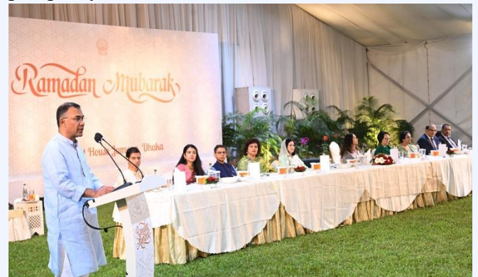
(Prime Minister Mr. Rahman addressing the gathering at Iftar)

Speaking on the occasion, the Prime Minister said his government is committed to strengthening ties with countries around the world based on mutual respect, trust, and cooperation. He expressed hope that, through cooperation and understanding, Bangladesh and the international community would move forward together in peace, development, and prosperity.