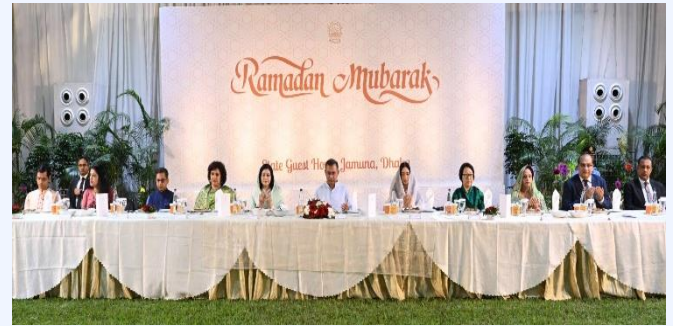
(Ambassador and his spouse attending an Iftar hosted by the Prime Minister)