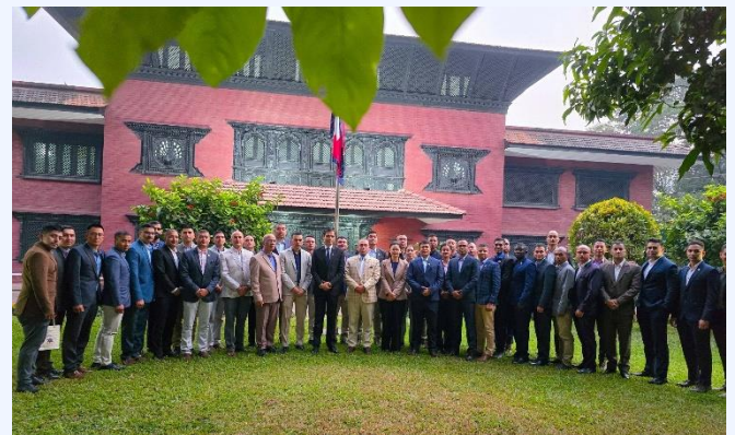
(Ambassador with the Staff College Delegation at the Embassy)

On 21 January, the Embassy hosted an interaction with a delegation from the Nepali Army Command & Staff College during their visit to Dhaka, Bangladesh, on a foreign study tour.