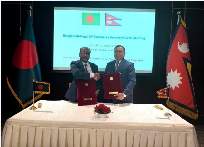
(The two Secretaries after the signing of the Agreed Minutes)

The Eighth Commerce Secretary Level Meeting (CSLM) between Nepal and Bangladesh was held from 13-14 January 2026 in Dhaka.