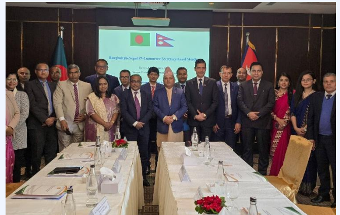
(Delegations of Nepal and Bangladesh during the 8 th CSLM)