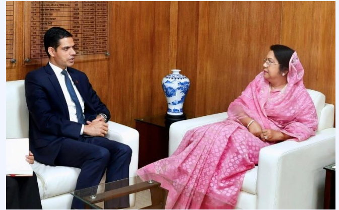
(Ambassador Mr. Bhandari with the Minister for Civil Aviation and Tourism)

The Ambassador underscored that tourism has emerged as a key area of cooperation, noting that approximately 60,000 Bangladeshi tourists visited Nepal in 2025.