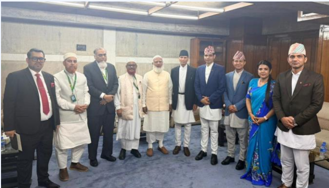
(Foreign Minister and his delegation with Leader of the Opposition and Ameer of Bangladesh Jamaat-e-Islami Dr. Shafiqur Rahman)

On 17 February, the Hon. Foreign Minister met with the Leader of the Opposition and Ameer of Bangladesh Jamaat-e-Islami Dr. Shafiqur Rahman.