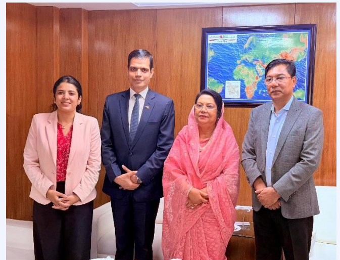
(Ambassador Mr. Bhandari with the Minister and State Minister for Civil Aviation and Tourism)

The Ambassador underscored that tourism has emerged as a key area of cooperation, noting that approximately 60,000 Bangladeshi tourists visited Nepal in 2025.