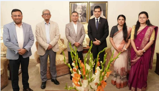
(Ambassador and the Embassy officials with the Chairman of BNP Mr. Rahman and BNP leaders)