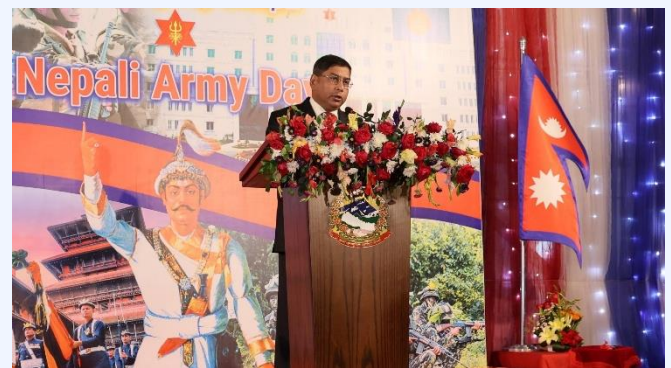
(Chief of the Army Staff of Bangladesh delivering his remarks)