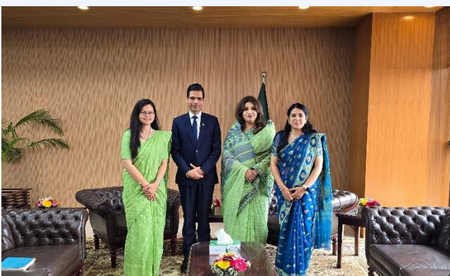
(Ambassador and the Embassy officials with the State Minister for Foreign Affairs)

While highlighting the growing economic engagements between the two countries, the State Minister underscored the increasing energy demand in Bangladesh and the vast hydropower potential of Nepal and stressed that the two countries need to make concerted efforts to enhance power cooperation for mutual benefit.