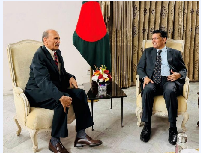
(Foreign Minister Mr. Sharma with Foreign Minister of Bangladesh Dr. Rahman)

The two Foreign Ministers reviewed the longstanding relationship between Nepal and Bangladesh, anchored in good neighbourliness, shared aspirations, and deep cultural connections.