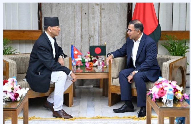
(Foreign Minister with Hon. Prime Minister H.E. Mr. Tarique Rahman)

The Foreign Minister also congratulated Mr. Rahman on leading the Bangladesh Nationalist Party to a resounding victory in the national elections held on 12 February and commended the Government of Bangladesh for the successful conduct of elections and smooth transition to the democratic process