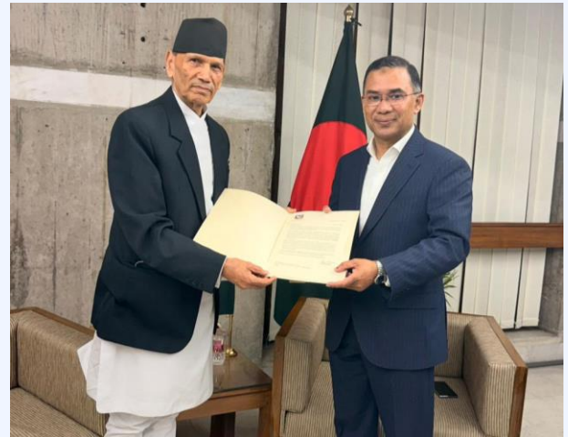
(Foreign Minister handing over the congratulatory message from the Rt. Hon. Prime Minister of Nepal)

and handed over a congratulatory message from the Rt. Hon. Prime Minister of Nepal Mrs. Sushila Karki. In her message, the Prime Minister congratulated Mr. Rahman on his election and expressed her willingness to work together in a spirit of mutual respect, shared commitment, and partnership to ensure that Nepal-Bangladesh ties continue to flourish for the mutual benefit of the two countries and peoples.