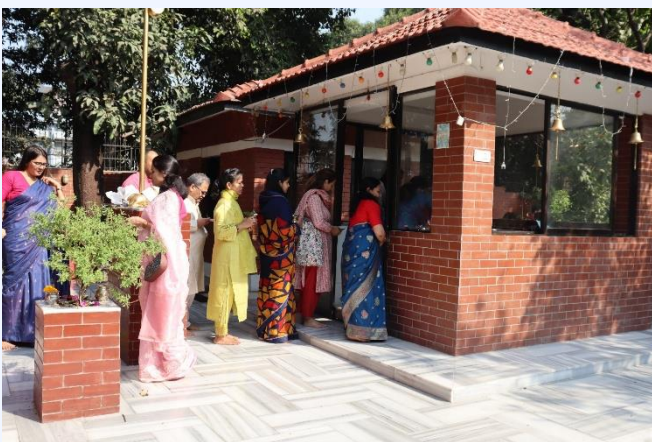
(Devotees offering their prayers at the Shiva temple)

On the auspicious occasion of Mahashivaratri, the Embassy extended greetings and best wishes to the people celebrating the festival on 15 February. The Shiva temple inside the Embassy premises was opened to the people from Nepali, Indian and Bangladeshi Hindu communities residing in Dhaka.