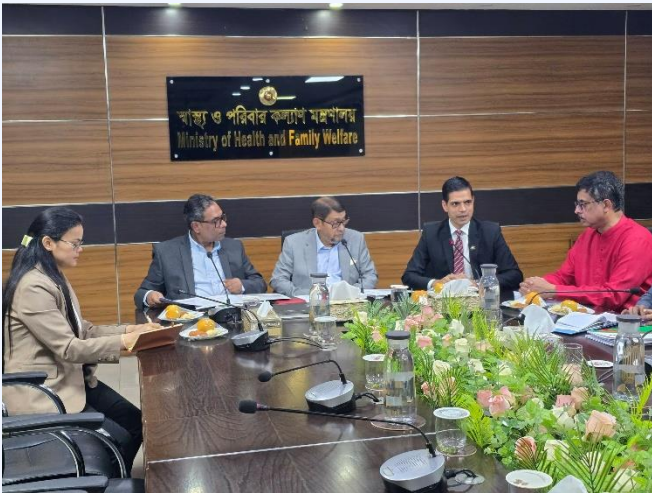
(Ambassador Mr. Bhandari during a call on the Minister and the State Minister for Health and Family Affairs)

They exchanged views on various aspects of Nepal-Bangladesh cooperation, highlighting the need for collaborative efforts in the sectors of health, medical education, and medical tourism. They also held discussion on matters concerning Nepali students studying in Bangladesh.