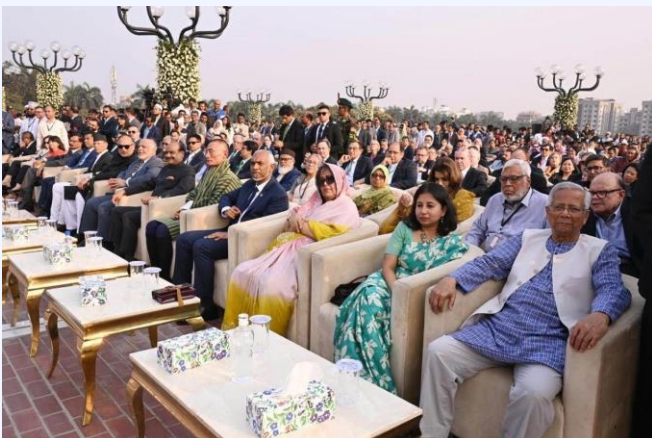
(Foreign Minister attending the Oath-taking Ceremony)

The event was attended by guests, including foreign dignitaries, high-ranking officials, diplomatic missions, members of Parliament, and leaders from political parties.