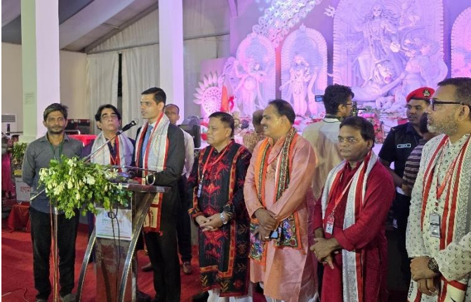
(Ambassador speaking at Puja Mandap in Banani)