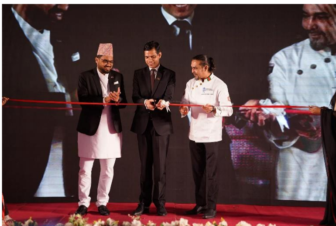
(Ambassador inaugurating the International Chef Day Event)