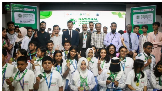
(Ambassador with the participants of the National Climate Championship 2024)

The Ambassador commended the young participants for demonstrating innovative ways through sports, artworks, projects, research works, and wall magazines, among others, to combat climate change. He also thanked the organizers for taking this novel initiative to engage youth in climate action.