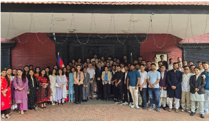
(The Embassy team with Nepali students)

On 1 November, the Embassy organized an interaction programme to exchange greetings and best wishes with Nepali students currently studying in Bangladesh on the auspicious occasion of Deepawali, Nepal Sambat and Chhath festivals for the year 2081.