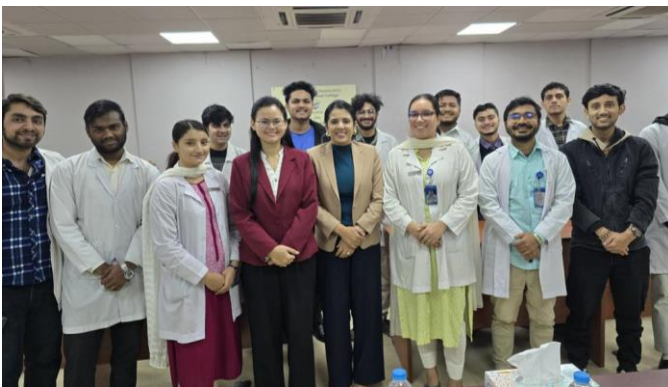
(Embassy team with Nepali students at Rajshahi Medical College)

They also had a meeting with the Principal and the Director of Rajshahi Medical College & Hospital and discussed about the overall issues and concerns of Nepali students.