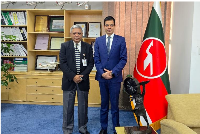
(Ambassador with MD & CEO of Biman Bangladesh Airlines)