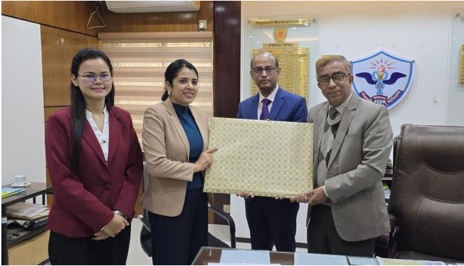
(Embassy officials with the Principal of Rajshahi Medical College)

On 12 December 2024, the Embassy officials visited Rajshahi Medical College in Rajshahi and had an interaction with Nepali students studying there.