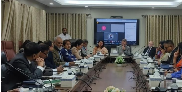
(DCM Ms. Silwal speaking at the event)

that Nepal is the first and only country in South Asia to criminalize marital rape.