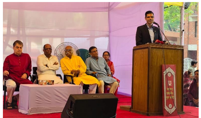
(Ambassador speaking at Dhakeshwori Temple)