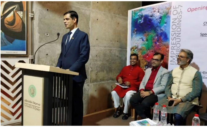
(Ambassador speaking at the solo painting competition)