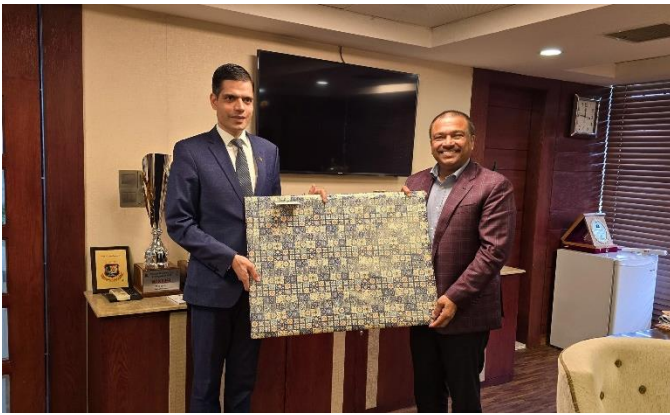
(Ambassador with President of Bangladesh Cricket Board)

President of the BCB appreciated Ambassador's proposal to organize friendly cricket matches between Nepal and Bangladesh. He also commended the remarkable progress and achievement of Nepali cricket team in the recent years.