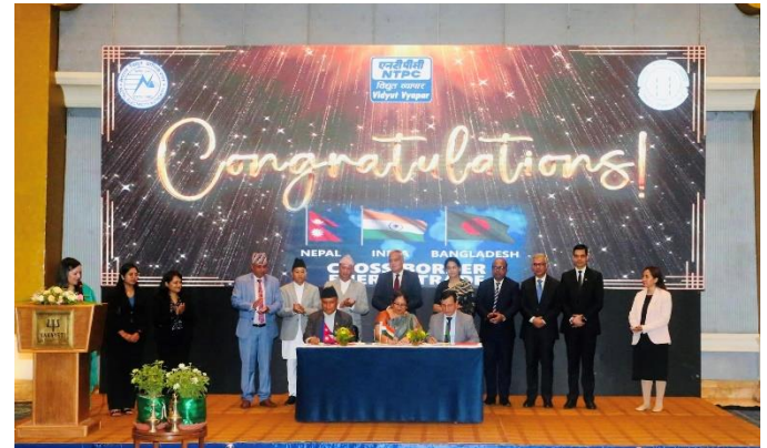
(Signing ceremony of Power Sales Agreement)

The agreement was signed between Nepal Electricity Authority (NEA), Bangladesh Power Development Board (BPDB), and NTPC Vidyut Vyapar Nigam (NNVN) of India amidst a special ceremony organized in Kathmandu. The historic agreement has enabled the first-ever energy trade at the sub-regional level and set the stage for further energy cooperation in the region.