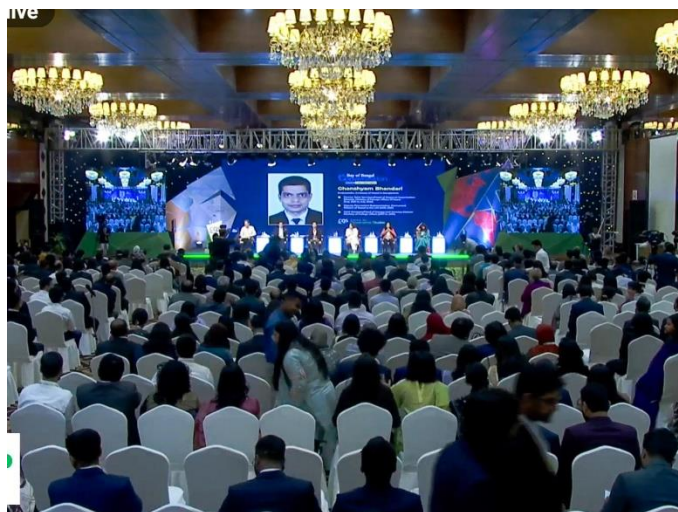
(Audience during a session at Bay of Bengal Conversation)

On the occasion, Ambassador Bhandari underscored that most of South Asia was at the sharp end of climate crisis and that countries like Nepal had been facing the toughest impacts despite their negligible contribution to global greenhouse gas emissions. He also highlighted measures taken by Nepal to align its development efforts with climate priorities. He stressed the need for clean energy solutions including the (sub)regional hydroelectricity trade to effectively address the adverse impacts of climate change.