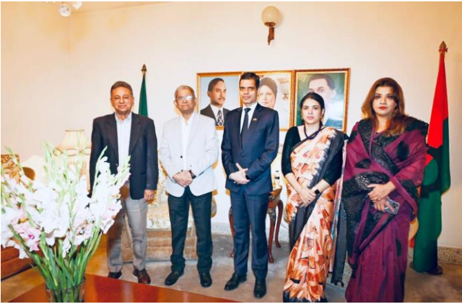
(Ambassador with BNP Secretary General)

The Secretary General stressed that Nepal and Bangladesh are close neighbours and good friends, which is evident in the immense goodwill our countries and people have for each other.