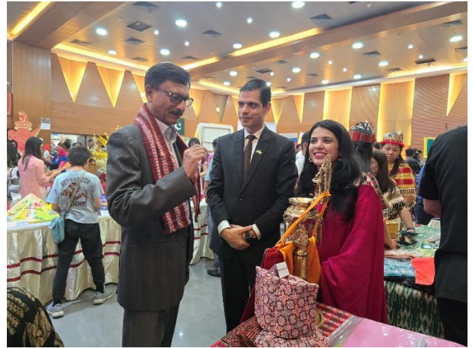
(Ambassador welcoming Foreign Affairs Adviser at the Nepali stall)