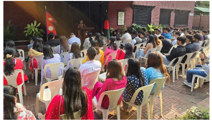
(Nepali students participating in the interaction programme at the Embassy)

The Ambassador encouraged the students to remain in close contact with the Embassy and requested them to report any incidents that may occur during their stay in Bangladesh. The students expressed their appreciation for the Embassy's efforts in coordinating with the concerned authorities of Bangladesh to ensure the safety and wellbeing of Nepali students.