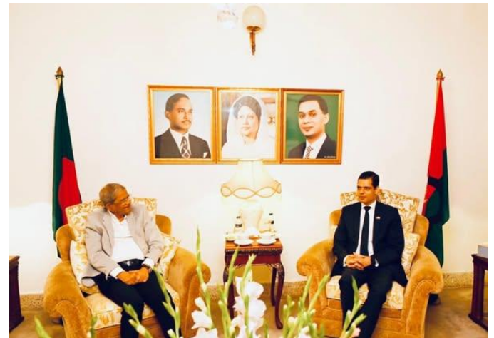
(Ambassador with Mr. Alamgir)