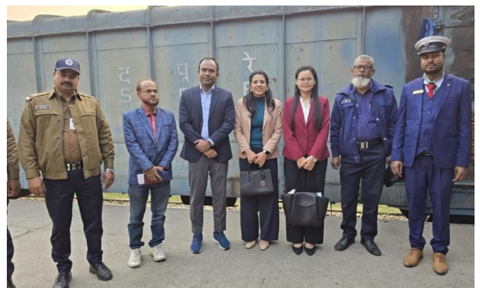
(The Embassy team with authorities of Rohanpur Railway Station)