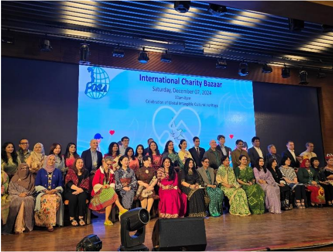
(Ambassadors and their spouses at FOSA Charity Bazar)

The Embassy participated at the International Charity Bazaar 2024 organized by Foreign Office Spouses Association of Bangladesh (FOSA) on 07 December.