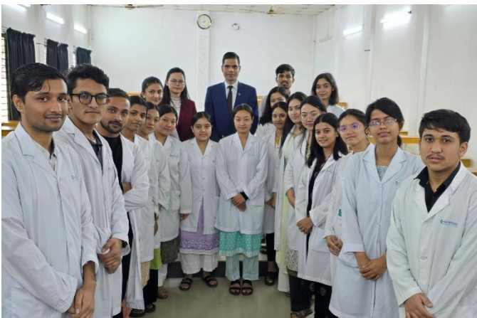
(Ambassador with Nepali Students at Khulna City Medical College)