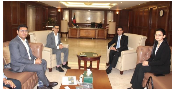
(Ambassador with Executive Chairman of BIDA)