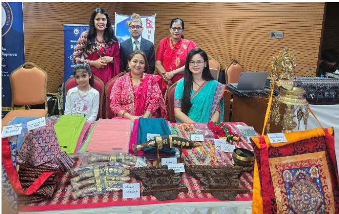
(The Embassy team displaying Nepali products at FOSA Charity Bazar)

The Embassy showcased Nepali products including handicrafts, pashminas, and traditional artifacts. A separate food stall of the Embassy at the Bazaar featuring Nepali delicacies including momos, selrotis, and choila, among others, also drew a large crowd present at the Bazaar.