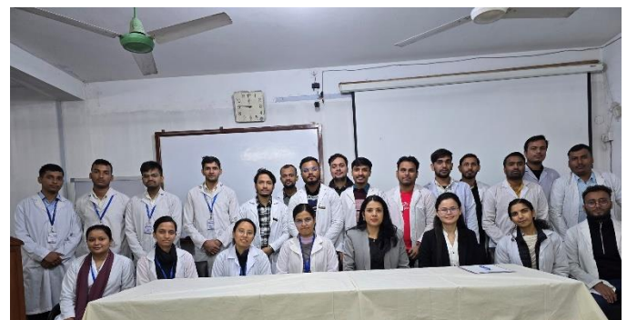
(Embassy officials with Nepali Students at North Bengal Medical College)