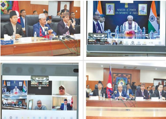
(Virtual inauguration of the power flow.)

The historic inauguration of the export of 40 MW hydroelectricity from Nepal to Bangladesh via the Indian grid took place on 15 November 2024, marking the implementation of the first-ever trilateral power-sales agreement among Nepal, Bangladesh, and India signed on 3 October. This milestone marks a significant step toward (sub)regional energy cooperation in South Asia.