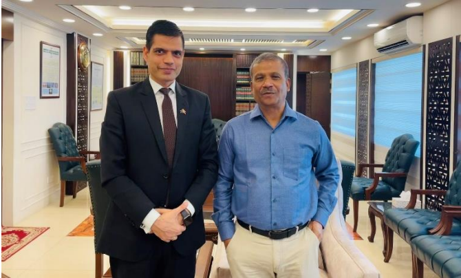
(Ambassador with Law, Justice & Parliamentary Affairs Adviser)

expressing solidarity with the people of Bangladesh in their efforts to restore peace and democracy.