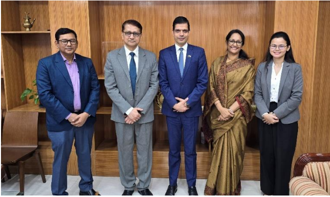
(Meeting with Secretary for Medical Education and Family Welfare)