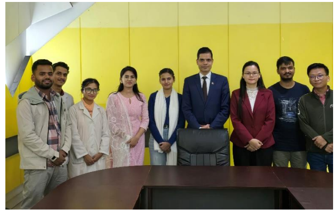
(Ambassador with Nepali Students of Gazi Medical College)

During the interaction, some of the students raised the issue of internship of Nepali medical students. They also requested for more regular visits by the Embassy to their medical college in Khulna.