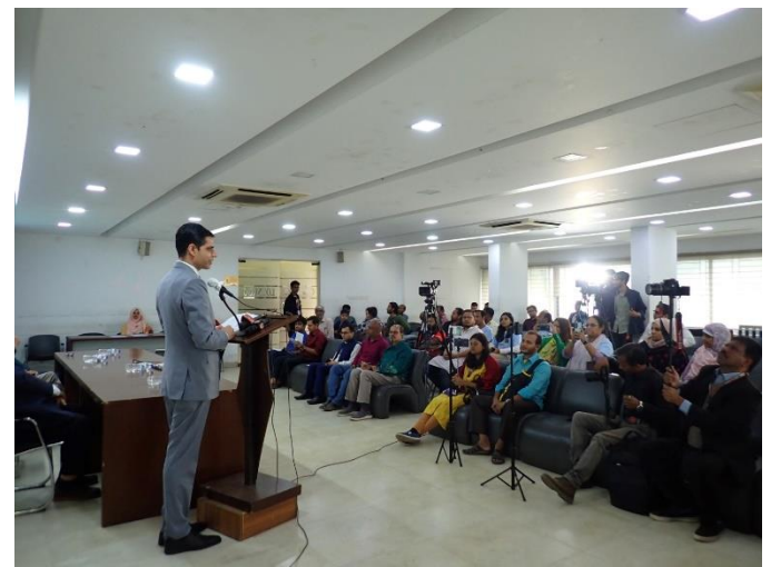
(Ambassador speaking at the flag-in ceremony)