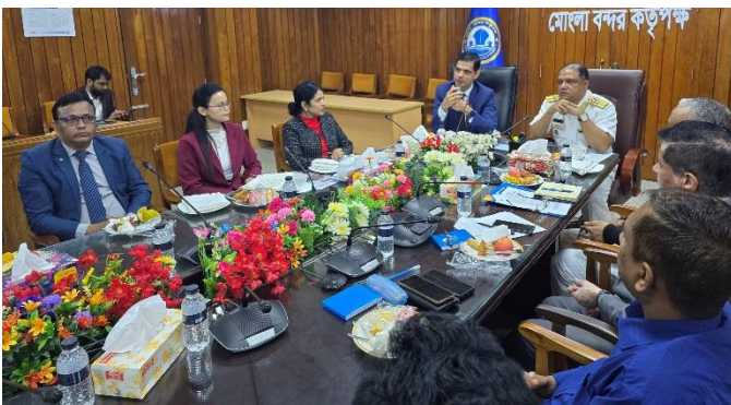
(Meeting with the Chairman and officials of Mongla Port Authority)