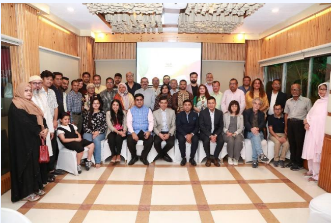
(Embassy family with members of BNFS)

The Ambassador also appreciated the contributions of BNFS in partnering with the Embassy to organize initiatives that promote cultural exchange and foster mutual understanding between the two nations.