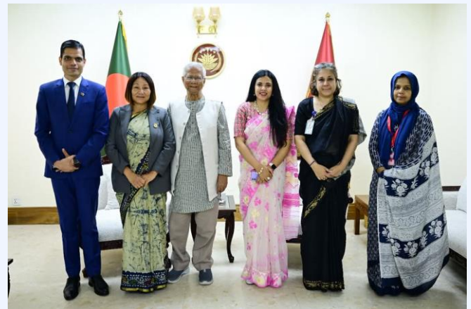
(Deputy Speaker, Ambassador and other officials with the Chief Adviser)

emissions. He also called for concerted efforts to boost economic cooperation with a particular focus on trade, connectivity, healthcare, and tourism.