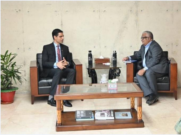
(Ambassador with the Foreign Secretary)

Referring to the tripartite power sales agreement for the export of 40 MW of electricity from Nepal to Bangladesh through the Indian grid, the Foreign Secretary acknowledged that the agreement was a significant and symbolic milestone, laying the foundation for future energy cooperation.