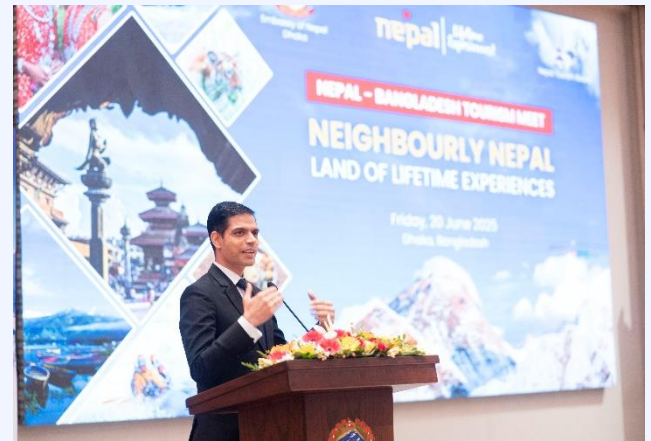
(Ambassador addressing the Nepal-Bangladesh Tourism Meet)