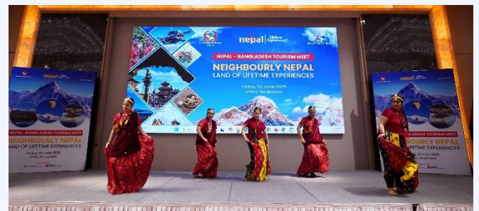
(Nepali students showcasing cultural performance)

Nepali folk cultural performances were presented during the event. Additionally, a raffle draw was held, offering prizes including round-trip air tickets for the Dhaka-Kathmandu sector sponsored by Himalaya Airlines and Biman Bangladesh Airlines, and exclusive holiday packages sponsored by participating tour and travel agencies of Nepal.