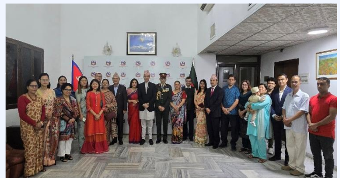
(Nepali nationals during Republic Day Celebration)

On the occasion, Ambassador Bhandari hoisted Nepal's national flag at the Embassy premises. He extended warm greetings to all Nepali citizens residing in Bangladesh, underscoring Nepal's significant democratic achievements, including the promulgation of the Constitution in 2015.