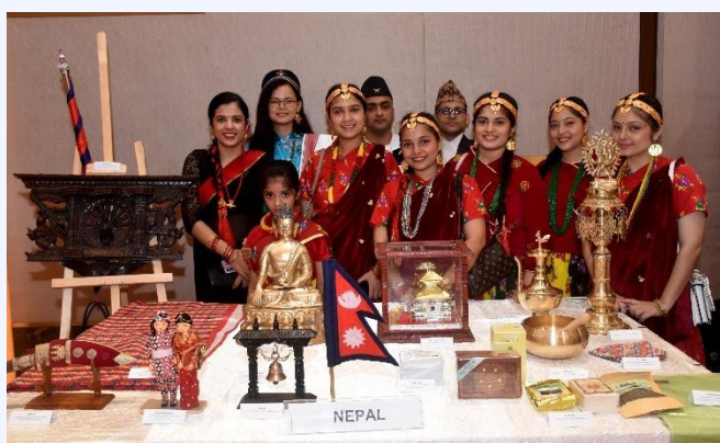
(Embassy's stall featuring Nepali handicrafts and niche products)