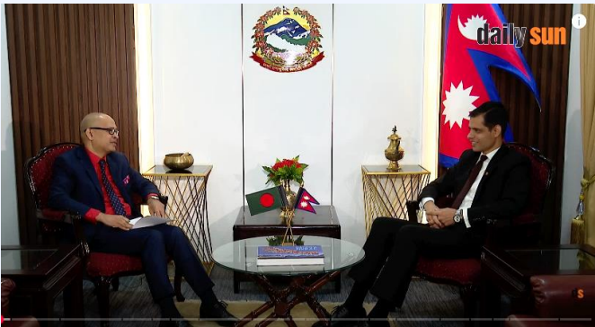
(Ambassador Bhandari during interview with the Daily Sun)

The interview focused on significant aspects of Nepal-Bangladesh relations, including trade, connectivity, energy, tourism, education, people-to-people exchanges, and cooperation at regional and international forums.