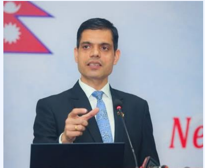
(Ambassador delivering his remarks at the event)

The Embassy organized a programme on “Nepal–Bangladesh Cooperation: Dynamics of Trade, Tourism, and Connectivity” in Khulna, Bangladesh, on 9 May 2025. The event brought together representatives of various Chambers of Commerce and Industries, prominent business leaders, travel and tour entrepreneurs, and media persons.