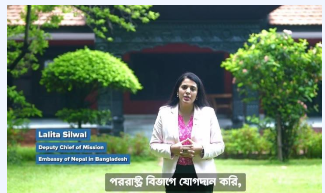
(DCM Ms. Silwal delivering her message)

In a video message compiled by the United Nations Development Programme (UNDP), Ms. Silwal highlighted the growing representation of women officers within Nepal's Ministry of Foreign Affairs. She also encouraged women and girls across South Asia to aspire for leadership roles and "break the glass ceiling" in the field of diplomacy.