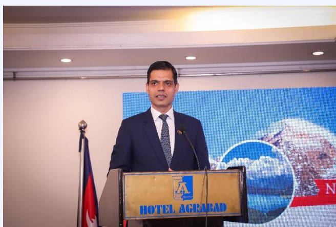
(Ambassador Bhandari delivering his remarks)

Speaking on the occasion, Ambassador Mr. Ghanshyam Bhandari emphasized the vital role tourism and people-to-people connections play in Nepal-Bangladesh relations. He shed light on the growing ties between the two countries and called for greater efforts to 'truly connect the heights of the Himalayas with the depths of the Bay of Bengal'.