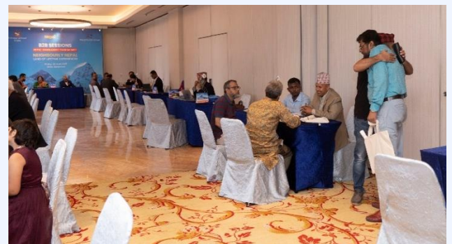
(Participants at the B2B session)

Prior to the formal ceremony, B2B and networking sessions were held between travel and tour entrepreneurs from the two countries.