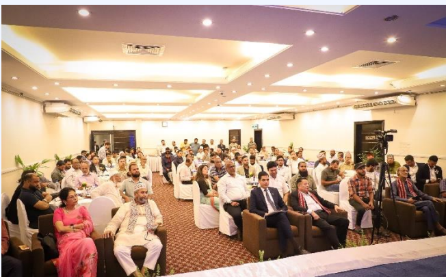
(Participants during the programme)

Prior to the formal ceremony, B2B and networking sessions were held among Nepali and Bangladeshi travel and tour entrepreneurs.