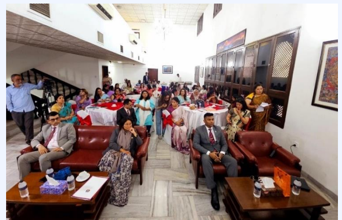
(Women journalists and guests participating in the interaction)