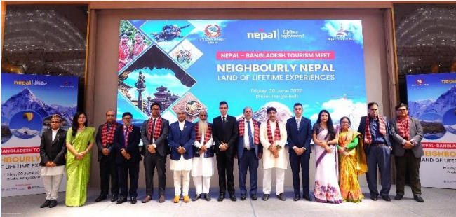
(Embassy team with dignitaries of the programme)

consolidating Nepal-Bangladesh relations. He emphasized the need to develop joint tourism packages positioning the two countries as complementary travel destinations to regional and international travelers alike.