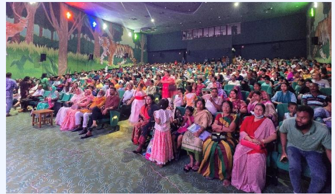
(Participants of the Children's Art Competition and Drama Exhibition)

their creative talent through their artworks.