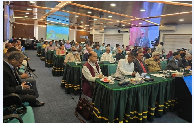
(Participants at the lecture)

The Ambassador also highlighted the civilizational and cultural linkages between the two countries and expressed satisfaction over the increasing number of tourism and people-to-people exchanges.