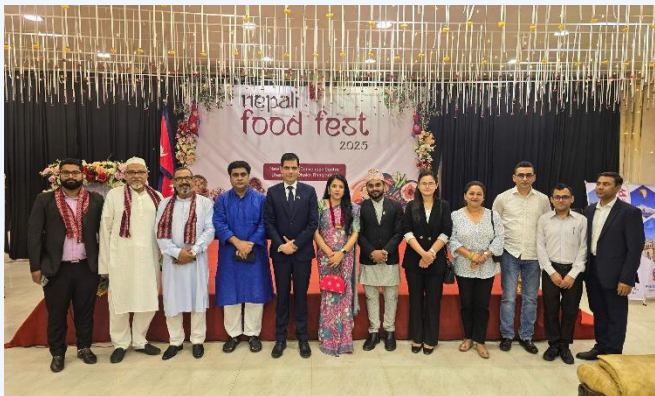
(Embassy officials attending the Nepali Food Fest)