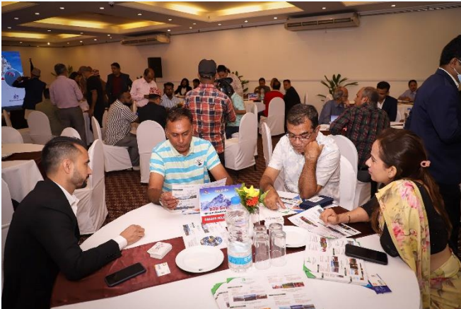
(Participants during B2B session)

The programme also featured a raffle draw, with tour packages and round-trip air tickets for the Dhaka–Kathmandu sector sponsored by Nepali tour and travel agencies, Himalaya Airlines and Biman Bangladesh Airlines.