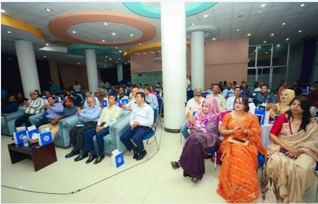
(Participants during the event)

cooperation. Queries and concerns of the participants were addressed in an interactive session following the presentation.