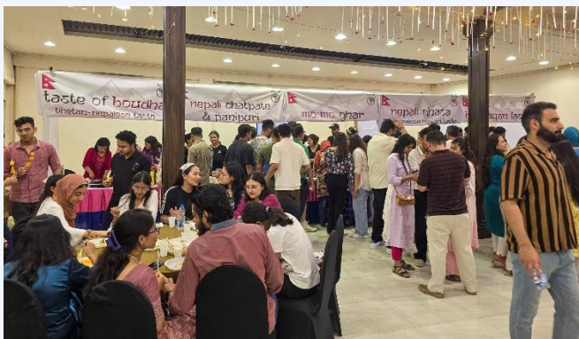
(Various Nepali food stalls at the Food Fest)

A student-led initiative, the Nepali food festival featured various Nepali food stalls, including a stall of Nepali handicraft products.