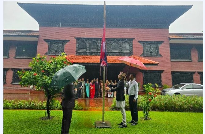
(Ambassador Bhandari hoisting the Nepali flag)

On 29 May 2025, the Embassy hosted a programme to observe the 18 th Republic Day of Nepal.