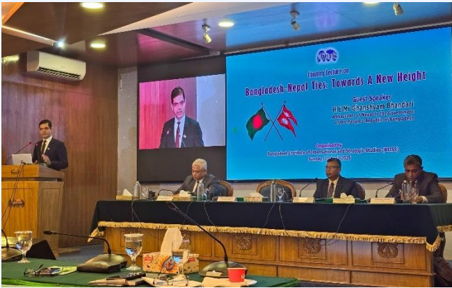
(Ambassador Bhandari delivering lecture at BISS)

people-to-people exchanges, and the shared pursuit of common goals through regional and multilateral frameworks. He also shed light on the progress achieved so far while also suggesting an outline of future guideposts.