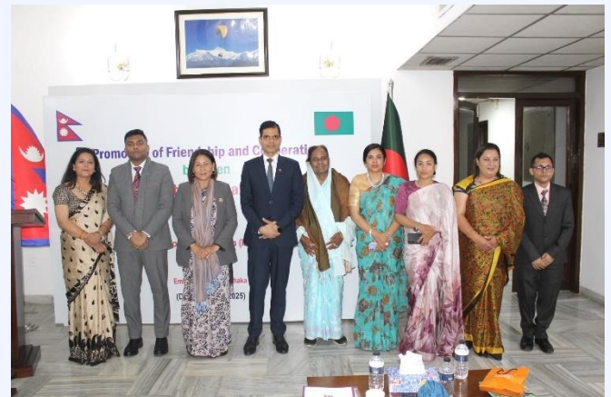
(Embassy team with Deputy Speaker and dignitaries)

Ambassador Mr. Ghanshyam Bhandari emphasized the vital role media women play in uncovering unique and often untold stories that give voice to the voiceless and the disadvantaged communities. He commended the IMW for bringing together women journalists from both Nepal and Bangladesh and stressed the role of such events in further promoting people-to-people contacts.