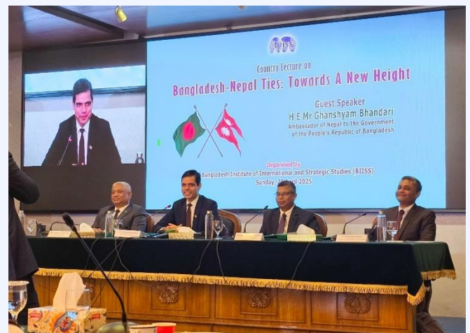
(Ambassador responding to questions after the lecture)