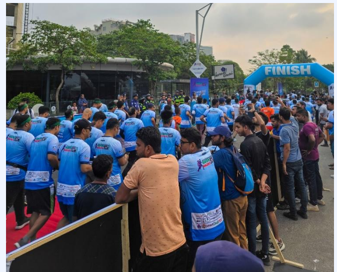
(Participants at the 'Beautiful Bangladesh Run 2025' marathon)