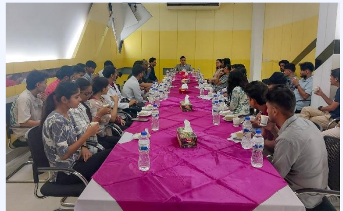
(Embassy team during the interaction)