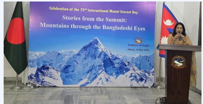
(Hon. Adviser Ms. Syeda Rizwana Hasan addressing the event)

Ministry of Environment, Forest, and Climate Change of Bangladesh H.E. Ms. Syeda Rizwana Hasan appreciated the courage and determination of Bangladeshi mountaineers in scaling some of the world’s most challenging peaks, including Mt. Everest.