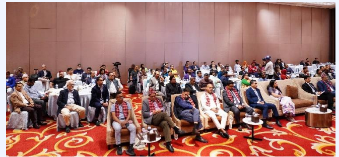
(Participants during the programme)