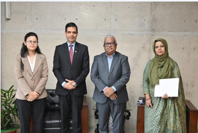
(Ambassador, Foreign Secretary, and officials from both sides)

The Foreign Secretary also noted the increasing number of Bangladeshi tourists visiting Nepal over the past years. He stated that there was huge potential for further growth in tourism cooperation with improved connectivity.