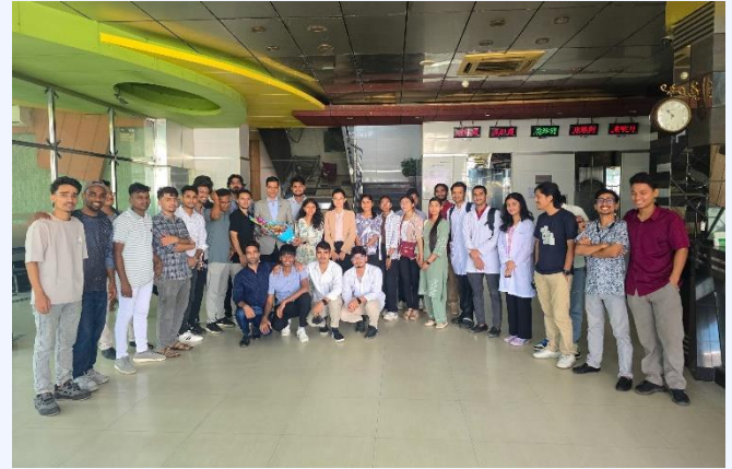
(Ambassador with Nepali students in Khulna)