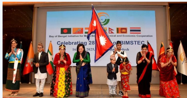
(The Embassy family showcasing Nepal's cultural diversity)

a country stall displaying the traditional Nepali handicrafts including wooden peacock windows, pashminas, Dhaka topis, Thanka paintings, and several other Nepali products. Nepali delicacies such as Momo and Chicken Choila were also included in the menu of the reception.