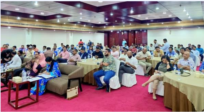
(Participants at the event in Cox's Bazar)

Participants of the event included representatives of business community, and travel and tour entrepreneurs based in Cox's Bazar.