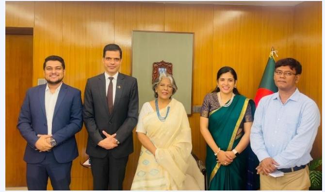
(Adviser, Ambassador, and officials from both sides)

As he handed over the invitation from Nepal's Environment Minister extending her participation in the first edition of the 'Sagarmatha Sambaad' to be held in Kathmandu on 16–18 May 2025, he shared with her both substantive and logistical details about the Sambaad . He further underscored that it was a flagship initiative of the Government of Nepal, established to deliberate on pressing regional and global issues.