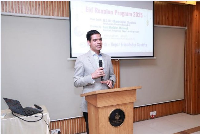
(Ambassador addressing the gathering at Eid Reunion Programme)