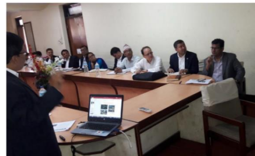
Minister of Forest and Environment (MoFE), Shakti B. Basnet reviewing the final draft of policy (2019)