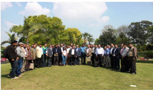
Participants with Honorable Minister Mr. Hari Prasadj Parajuli at the closing of consultation workshop (2015)