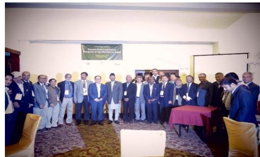
Participants during a national consultation workshop on agroforestry policy with Honorable Minister of Forest and Soil Conservation Mr. Mahesh Acharya (Centre in traditional dress) (2015)