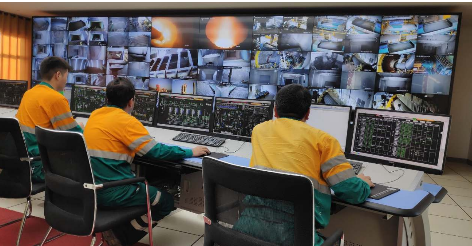
A fully-computerized Central Control Room (CCR) of Hongshi Shivam Cement Pvt. Ltd. in Sardi, Nawalpur.

around 50 MW of energy in the first phase and 80 MW in the second phase when production capacity will be doubled. The government has started erecting transmission line towers that will provide dedicated electricity to the project. ♦