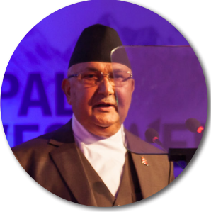
RIGHT HONORABLE MR. K P SHARMA OLI Prime Minister and Chairman, Investment Board Nepal

Here is a government that is stable and remains fully committed to protecting your investment with assured profits. I am sure all this will inspire you to make Nepal a second home, a place of your constant interest, and a hub of your business. Nepal offers many more things. Let's jointly explore and share!